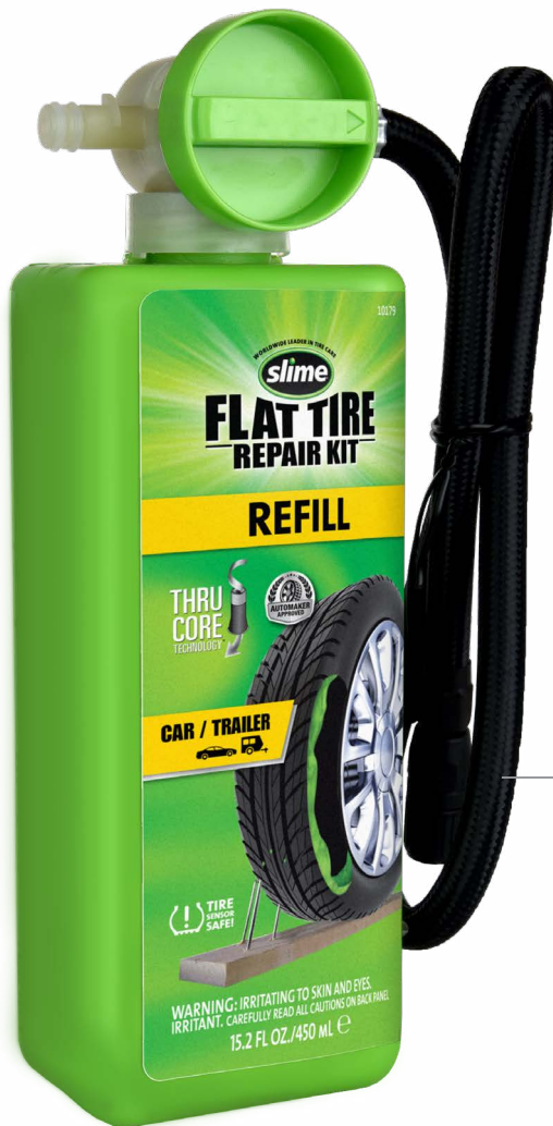
SEALANT/ AIR HOSE