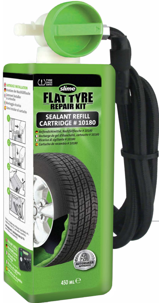
SEALANT/ AIR HOSE