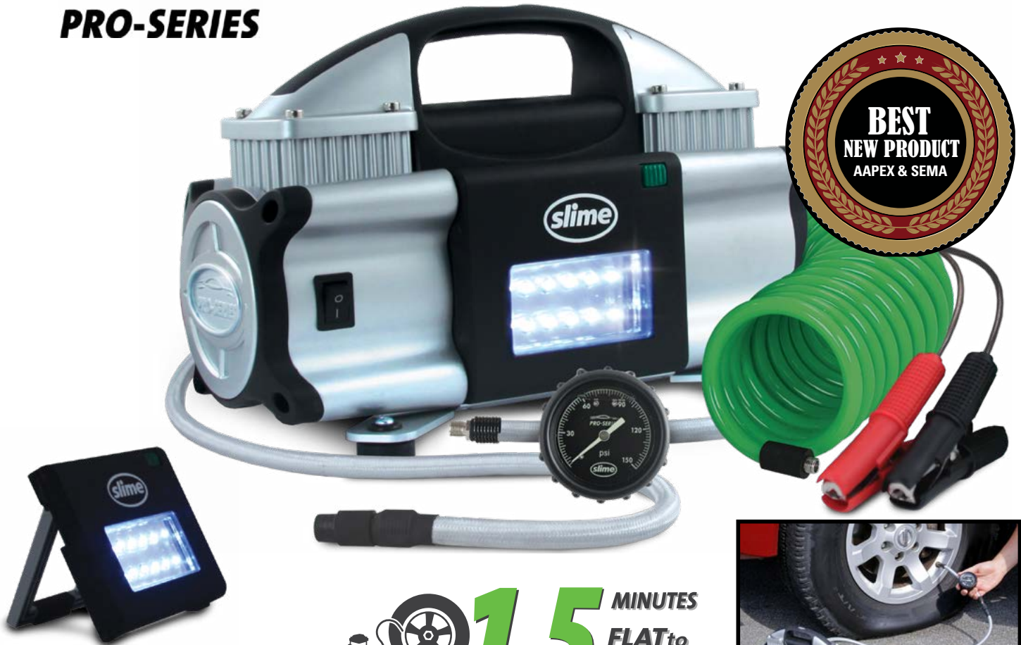
Removable Magnetic 400 Lumen LED Light

1.5 MINUTES FLAT to FULL *Standard Car Tire