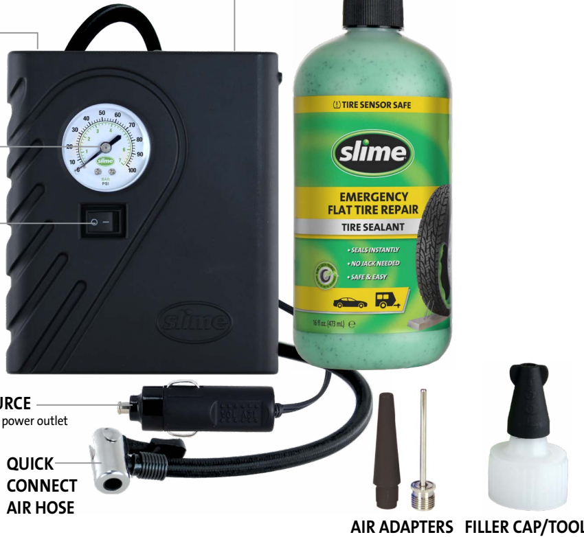
AIR ADAPTERS FILLER CAP/TOOL